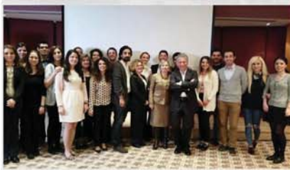
Turkish Pediatric Association

believing in us and supporting us. We promise to put more effort in making this congress annually with your support. We would like to thank once more to the president and board of the TPA, all speakers from Turkey and abroad and you colleagues for great scientific contributions.