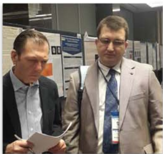
Turkish Pediatric Association